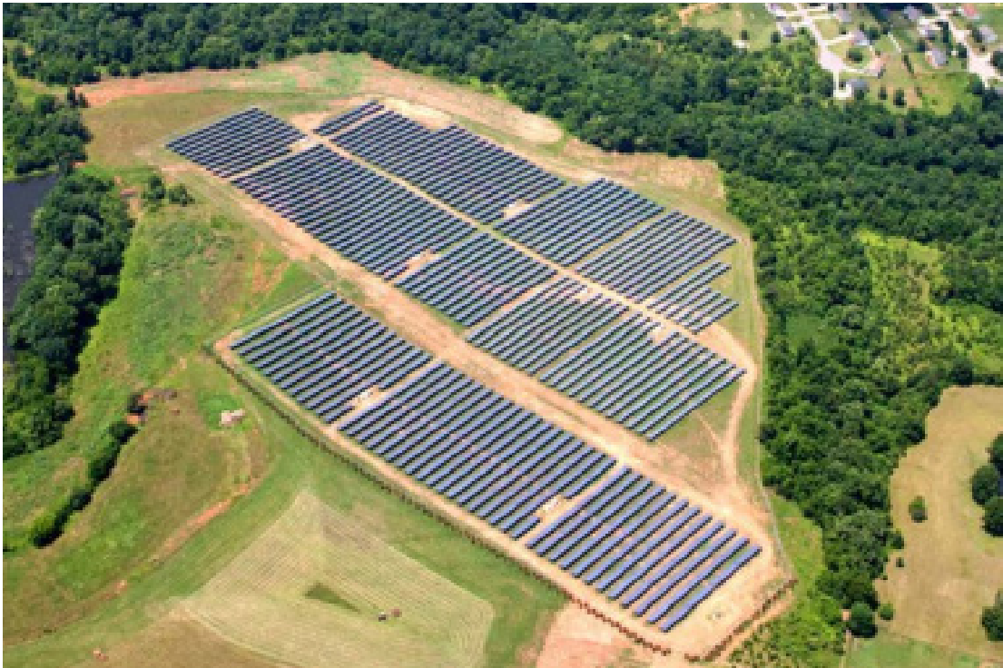
Figure 1: Utility-scale solar facility (5 MWAC) located in Catawba County.

The system installation, or construction, process does not require toxic chemicals or processes. The site is mechanically cleared of large vegetation, fences are constructed, and the land is surveyed to layout exact installation locations. Trenches for underground wiring are dug and support posts are driven into the ground. The solar panels are bolted to steel and aluminum support structures and wired together. Inverter pads are installed, and an inverter and transformer are installed on each pad. Once everything is connected, the system is tested, and only then turned on.