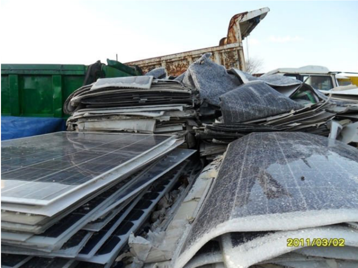
Figure 4: The mangled PV panels in this picture illustrate the nature of broken solar panels; the glass cracks but the panel is still in one piece.

PV panels constructed with the same basic components as modern panels have been installed across the globe for well over thirty years. 3 The long-term durability and performance demonstrated over these decades, as well as the results of accelerated lifetime testing, helped lead to an industry standard 25-year power production warranty for PV panels. These power warranties warrant a PV panel to produce at least 80% of their original nameplate production after 25 years of use. A recent SolarCity and DNV GL study reported that today's quality PV panels should be expected to reliably and efficiently produce power for thirty-five years. 4